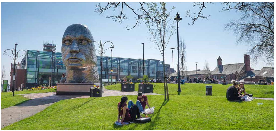
The Wiend, Wigan