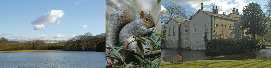
- United Utilities visitors centre -