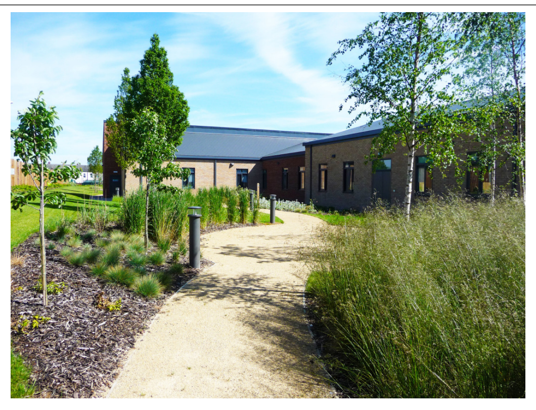
Picture 3.4 The external areas of the Atherleigh Park mental health unit are designed to provide mental health benefits to residents and visitors and are also open to use from the general public.