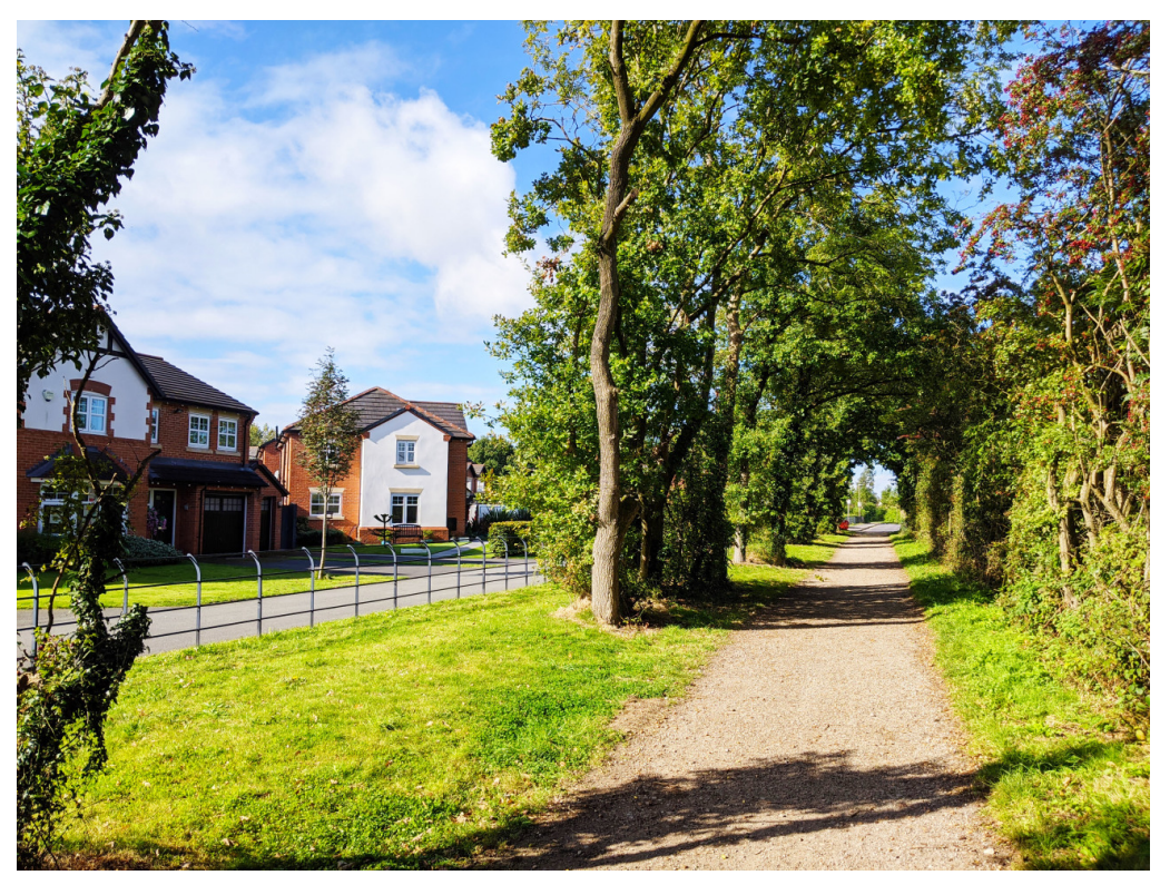
Picture 3.10 This development has connectivity to the wider GI network through public rights of way and retention of historic field boundaries linking to the wider countryside.