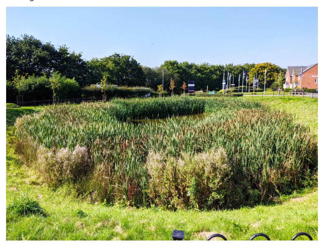
Picture 3.2 Sustainable drainage solutions such as this pond and reed bed reduce flood risk whilst also enhancing biodiversity and improving water quality.