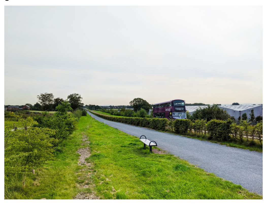
Picture 3.5 The Leigh Salford Manchester Guided Busway has a 3m multi user route running its length through the borough and has been highly successful in encouraging walking and cycling.