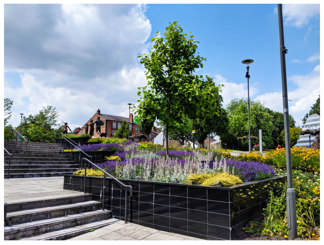
Picture 3.3 This planting scheme creates vibrant colours but also varied scents, it is also good for pollinators.