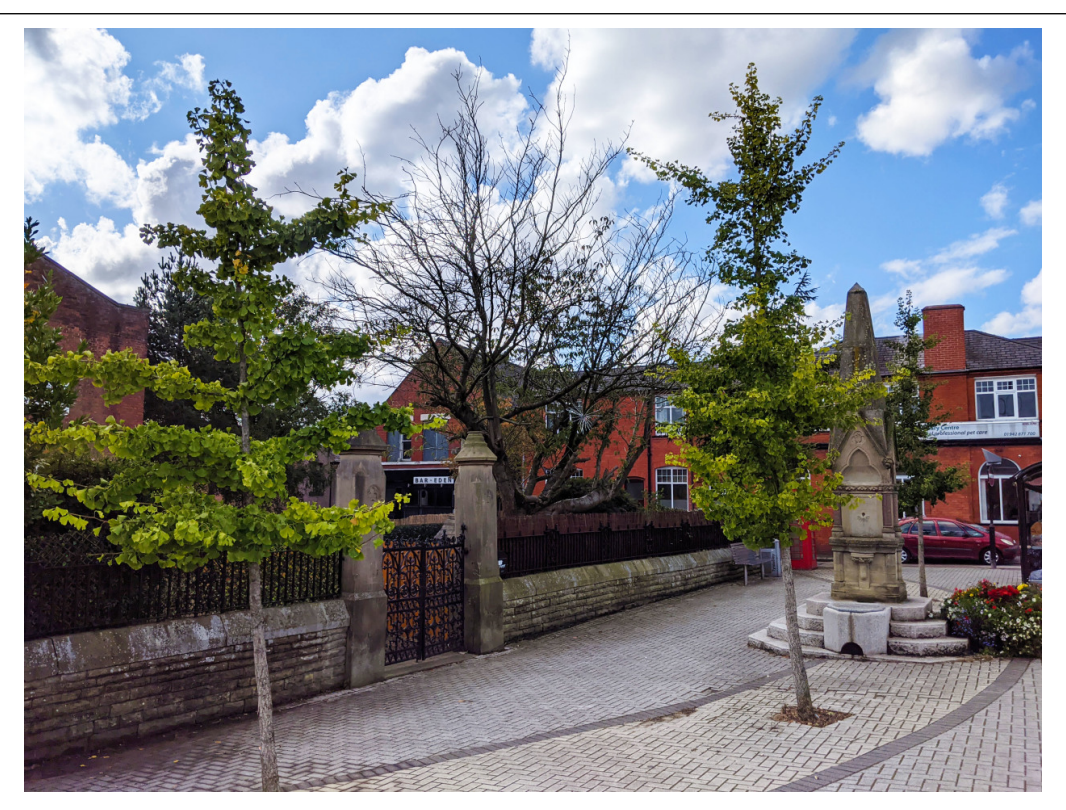
Picture 3.1 These Maidenhair trees (Ginkgo biloba) although not native, are incredibly resilient to tough urban environments and will help provide shade to this area of public realm as they mature.