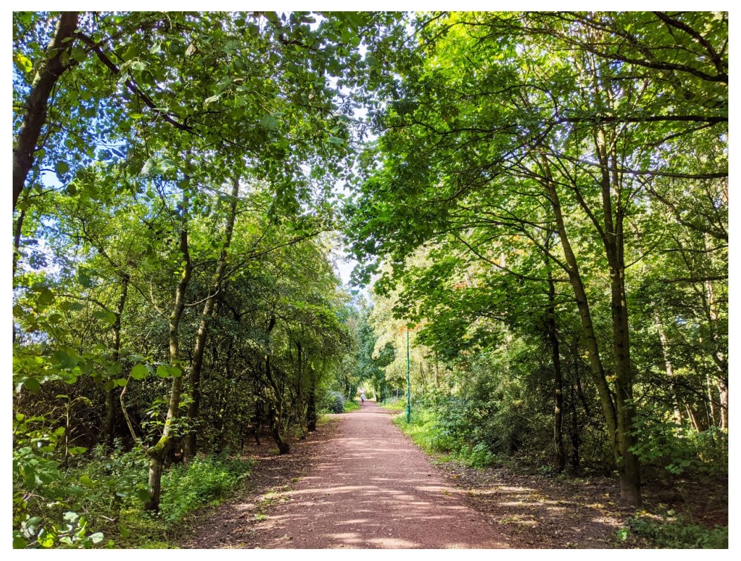
Picture 3.6 The former Standish Mineral line has been upgraded to create a multi-user route for local residents connecting new and existing residential areas to the town centre and beyond.

3.19 Landscape design and green infrastructure have a key role to play in creating environments that promote walking, cycling and active lifestyles in general. Landscape design submissions for development in Wigan should help to create high quality streets and spaces, a network of multi-functional open space, walkable communities and better-connected longer distance walking and cycling routes, such as the guided busway in picture 3.6. Creating the right built environment to encourage more sustainable travel is a key objective for Wigan particularly in response to the changing climate and our carbon neutrality targets. Further detail on Active Design can be found in Sport England and Public Health England's Active Design principles.