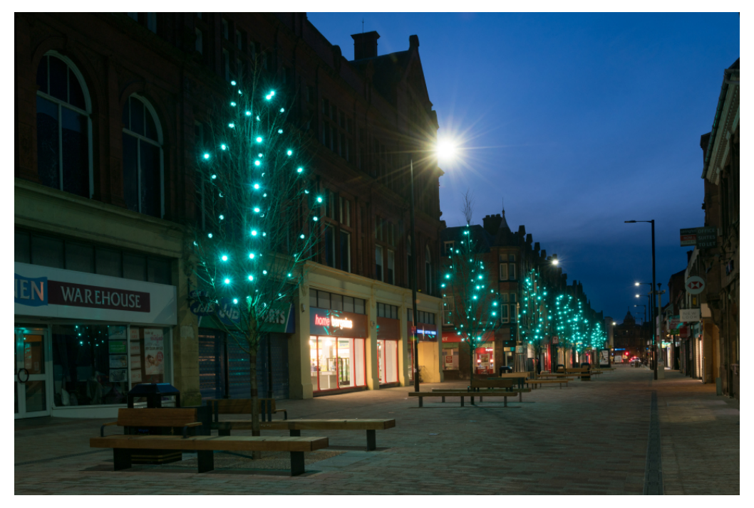
Picture 3.8 This new public realm scheme includes lighting as a key feature to promote its use and enhance safety after dark.

3.26 Development is expected to create inclusive environments suitable for all members of society but with emphasis on the most vulnerable and for example those with impaired sight and mobility, the old and very young. This is particularly important for landscape design given that it can greatly influence the ease of use of the outdoor environment for many people. Using landscape design to create an outdoor environment that is accessible for all and feels safe and welcoming. Regard should be given through the design process to providing alternatives to steps, avoiding steep gradients and using hard landscaping materials which allow easy access for all. The appropriate use of lighting should also be considered to ensure that environments are suitably lit to ensure ease of use and safety.