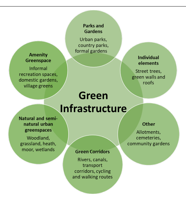
Figure 1.1 The components of Green Infrastructure.