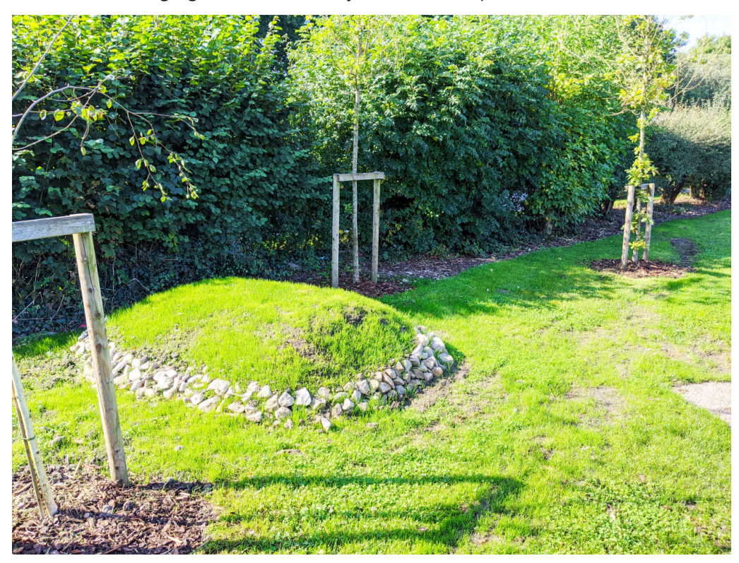
Picture 3.7 This open space includes hibernacula (a man made mound for hibernation) for Great Crested Newts