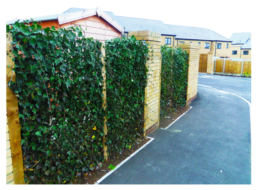
Picture 3.9 The impact of boundaries on the street scene can be softened with the use of living fence panels, Ivy is also shown to improve air quality.