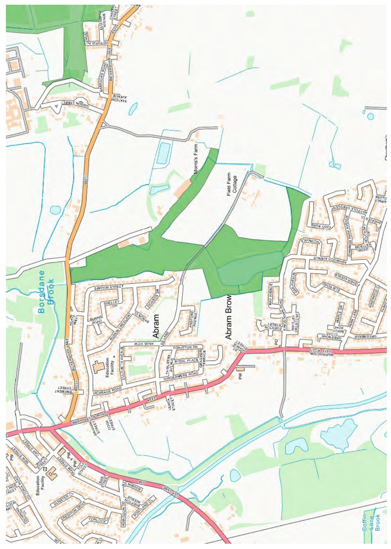
Map D: Kingsdown Flash [known locally as Polly's Pond]