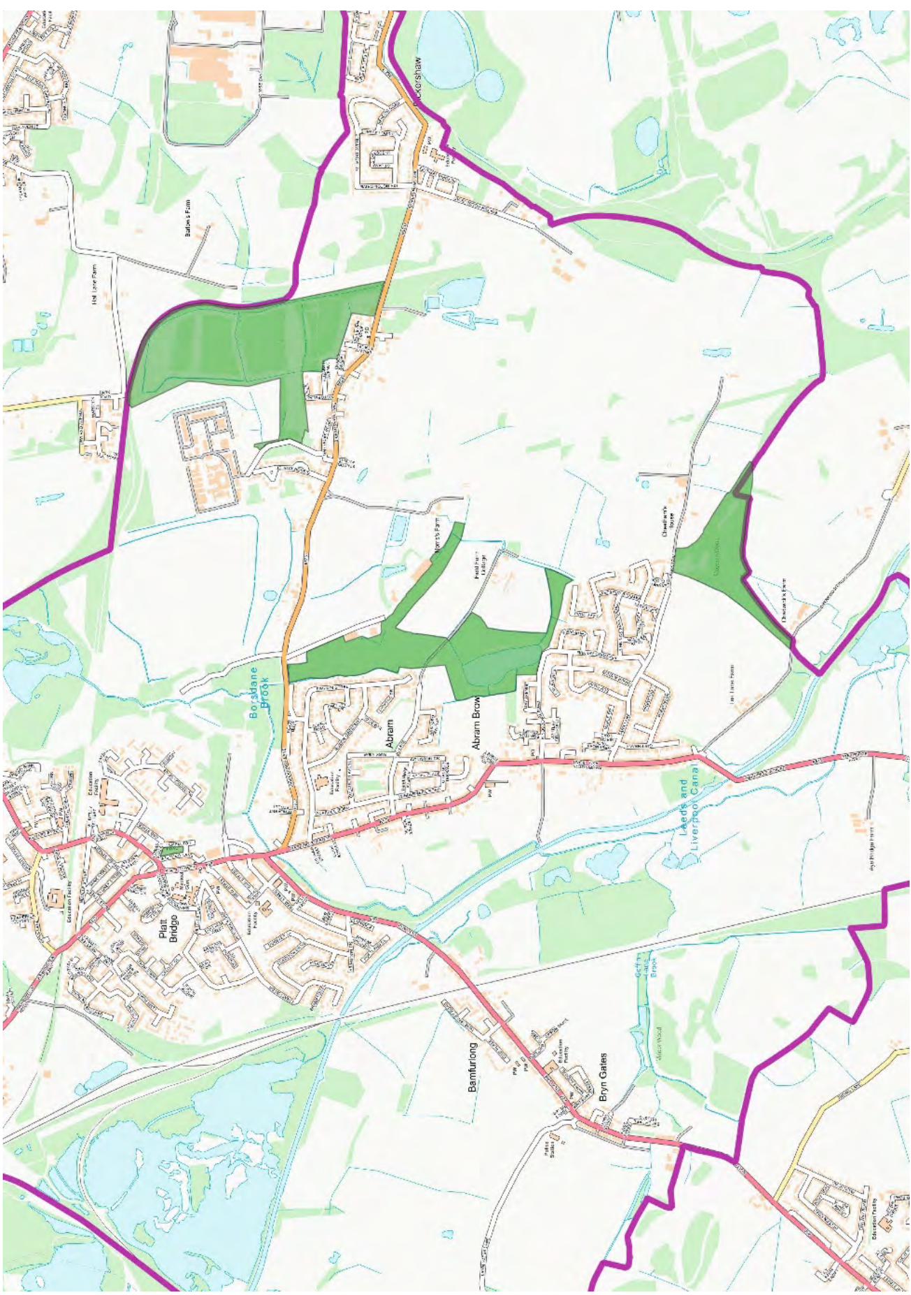
Map A: The ACT Neighbourhood Area