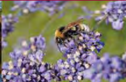
- Bumblebee on lavender -