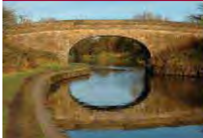
- Sennicar Bridge -