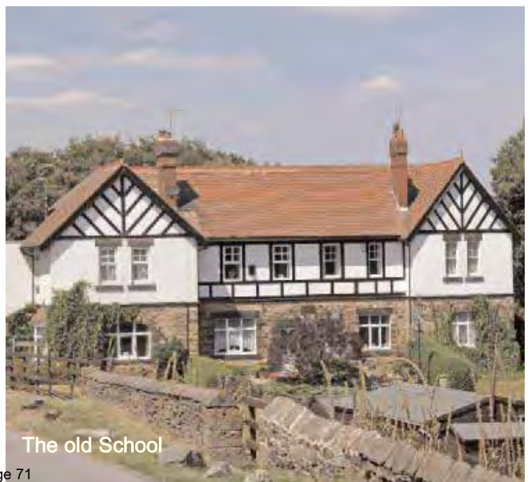
The old School