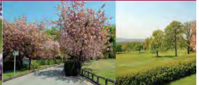
- Haigh Hall entrance -